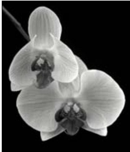
Phaleonopsis Orchid by Michael Martin

The lighting was provided by a video light with barn doors shining through a semi transparent reflector on the right and another reflector on the left to bounce light back across to balance contrast across the face of the flowers. A large proportion of the main light was directed across the rear of the flowers to make them glow and show more of the structure. A low white ceiling to reflect light downward and a black velvet backdrop completed the set up.