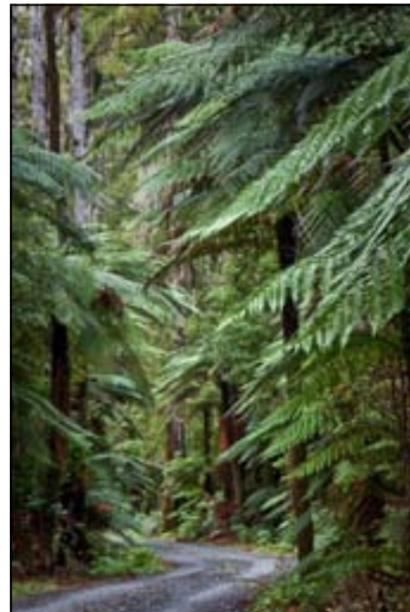
Accepted - Intermediate Colour Print KCPS Autumn Salon