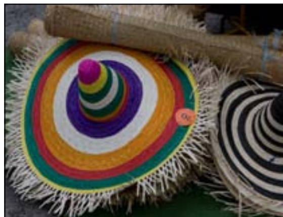
Sombrero by Peter Knapp Accepted - Intermediate Colour Print KCPS Summer Salon