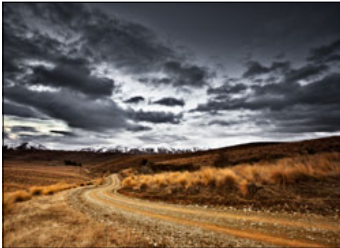
The Rail Trail - Winter by Shona Jaray

Honours - Advanced Colour Print KCPS Winter Salon