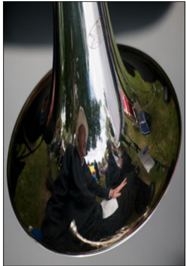
Band at Rest by Horia Voica

Honours - Intermediate Projected Images KCPS Winter Salon