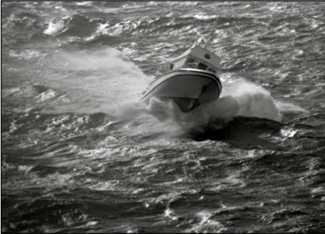
Lady Elizabeth 111 Braving the Strait

This month's image shows the police launch Lady Elizabeth 111 having a tough time keeping up while on picket duty during a helicopter drill involving the ferry Kaitaki in Cook Strait.